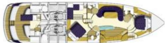
Standard layout with optional crew cabin